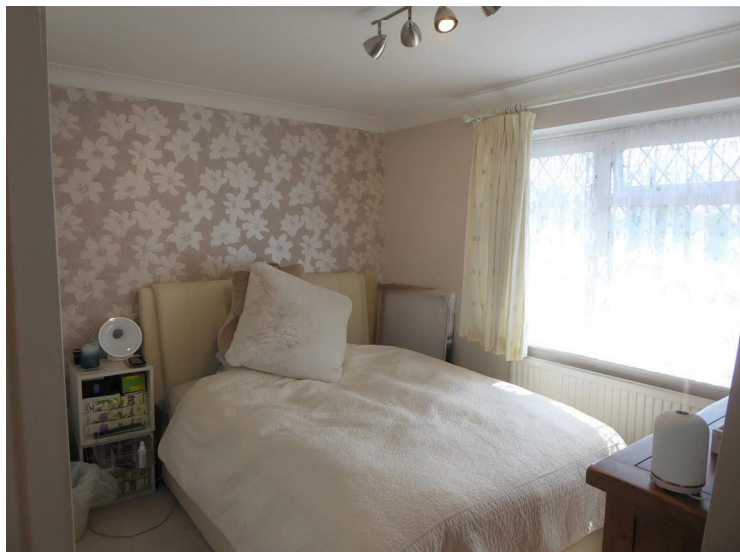
Front aspect double glazed window, fitted wardrobes, radiator, coving, carpet.