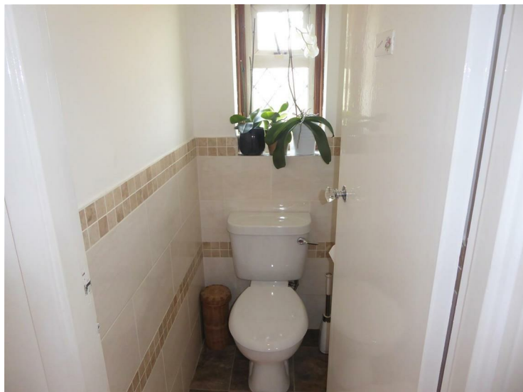
Low level w/c, side aspect double glazed window, vinyl flooring.