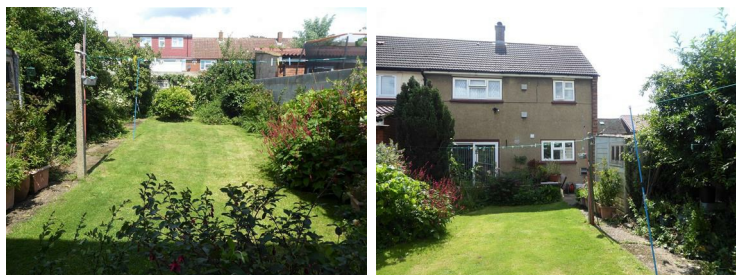
Laid to lawn with a variety of shrubs.