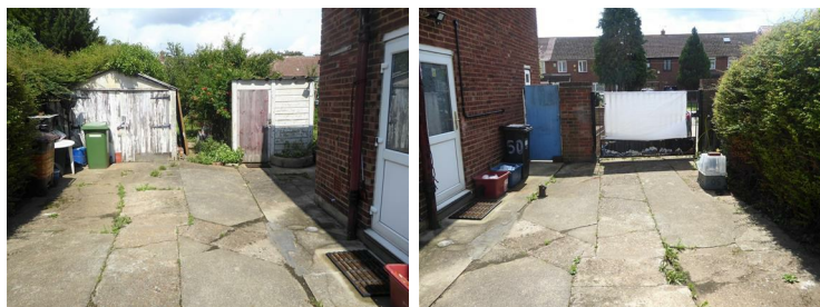
Own driveway to side. providing off street parking leading through to double gates providing further off street parking in front of detached garage. 15ft side space with potential for development and extend (stpp).