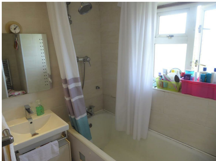
Modern suite comprising panel enclosed bath with shower, hand wash basin in vanity unit, tiled walls, vinyl flooring, heated chrome towel rail, rear aspect double glazed window.